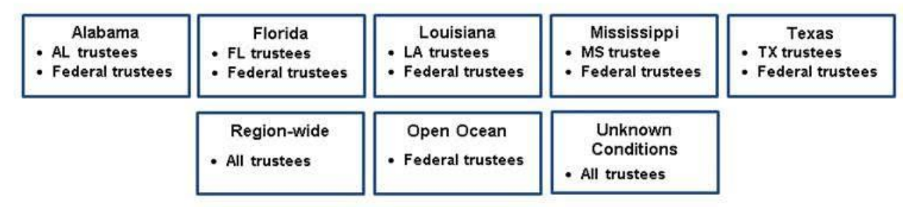
Figure 3: Trustee implementation groups (adapted from PDARP, Figure 7.2-1).

Each of these groups has different responsibilities, but most decisions about restoration moving forward will be made by the TIGs. There is one TIG for each of eight different "restoration areas" (one covering each Gulf state, open ocean, region-wide, and "unknown conditions") (see Figure 3).