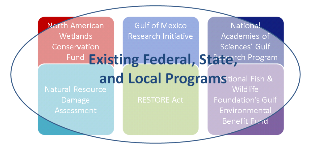
Figure 1 : Complexity of Gulf restoration and recovery.

As a result of the Deepwater Horizon oil spill, a number of different funding processes have been put in place to help restore and recover the Gulf of Mexico. The three main ones are the natural resource damage assessment (NRDA), the RESTORE Act, and the National Fish & Wildlife Foundation (NFWF) Gulf Environmental Benefit Fund (GEBF), which together will distribute over $16 billion. Each of these processes has its own objectives, timelines, governance structure, and opportunities for the public to engage. These processes also involve a number of different federal, state, and other entities. At the same time, there are a number of federal, state, and local programs that were in place prior to the spill (see Figure 1). Coordination among these varied efforts will therefore be essential.<sup>1</sup>