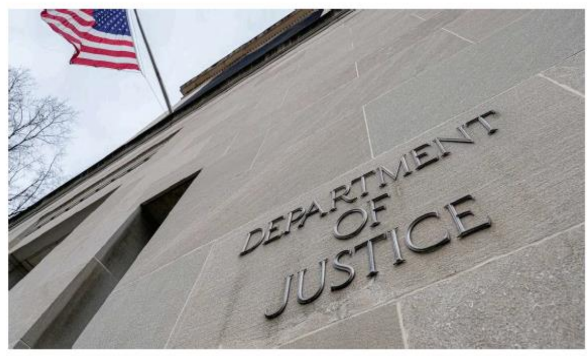
A California man was charged with smuggling greenhouses gases from Mexico into the US, according to the Department of Justice.