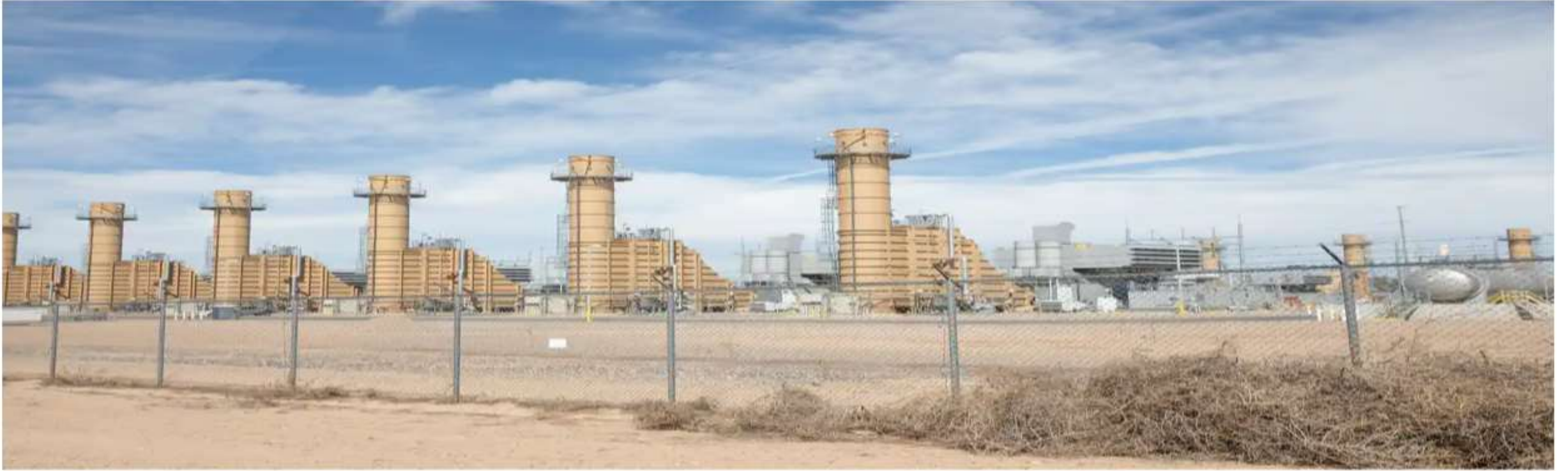
📷 The stacks of the Salt River Project generating station near Randolph, Arizona.

Residents in industry-choked Randolph renew efforts to block the power company's plans near their fragile town