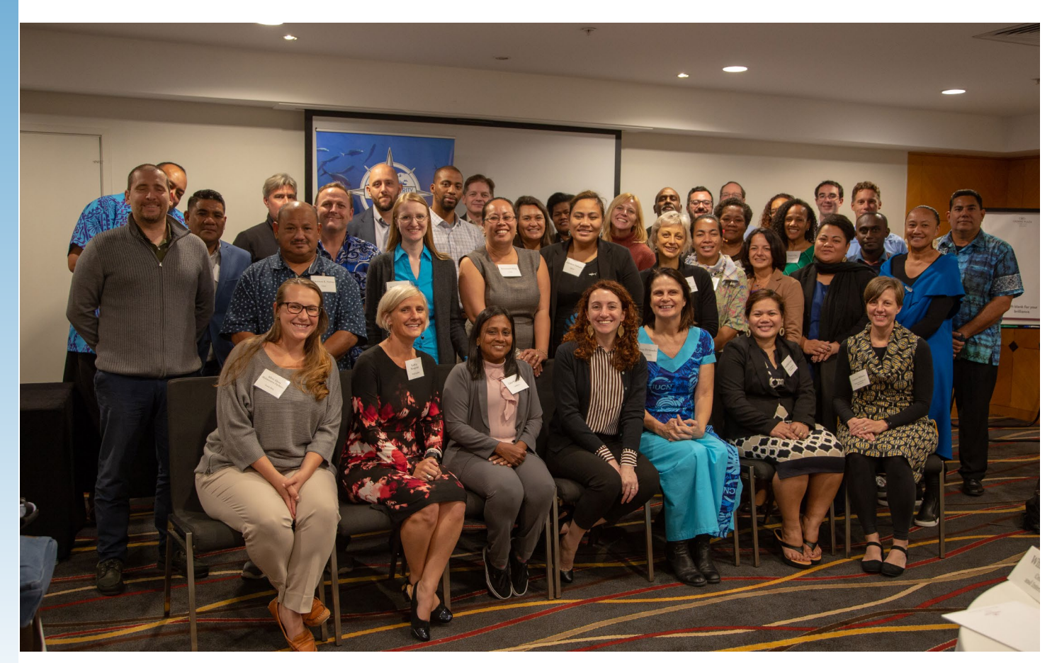
Participants of the 2019 Blue Prosperity Workshop in Auckland, New Zealand