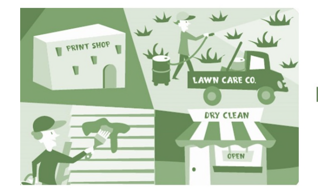
Hazardous Waste Generation