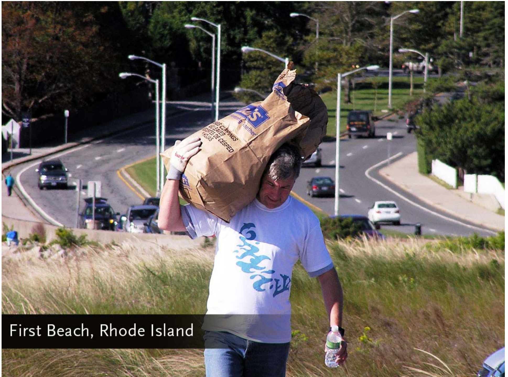
First Beach, Rhode Island