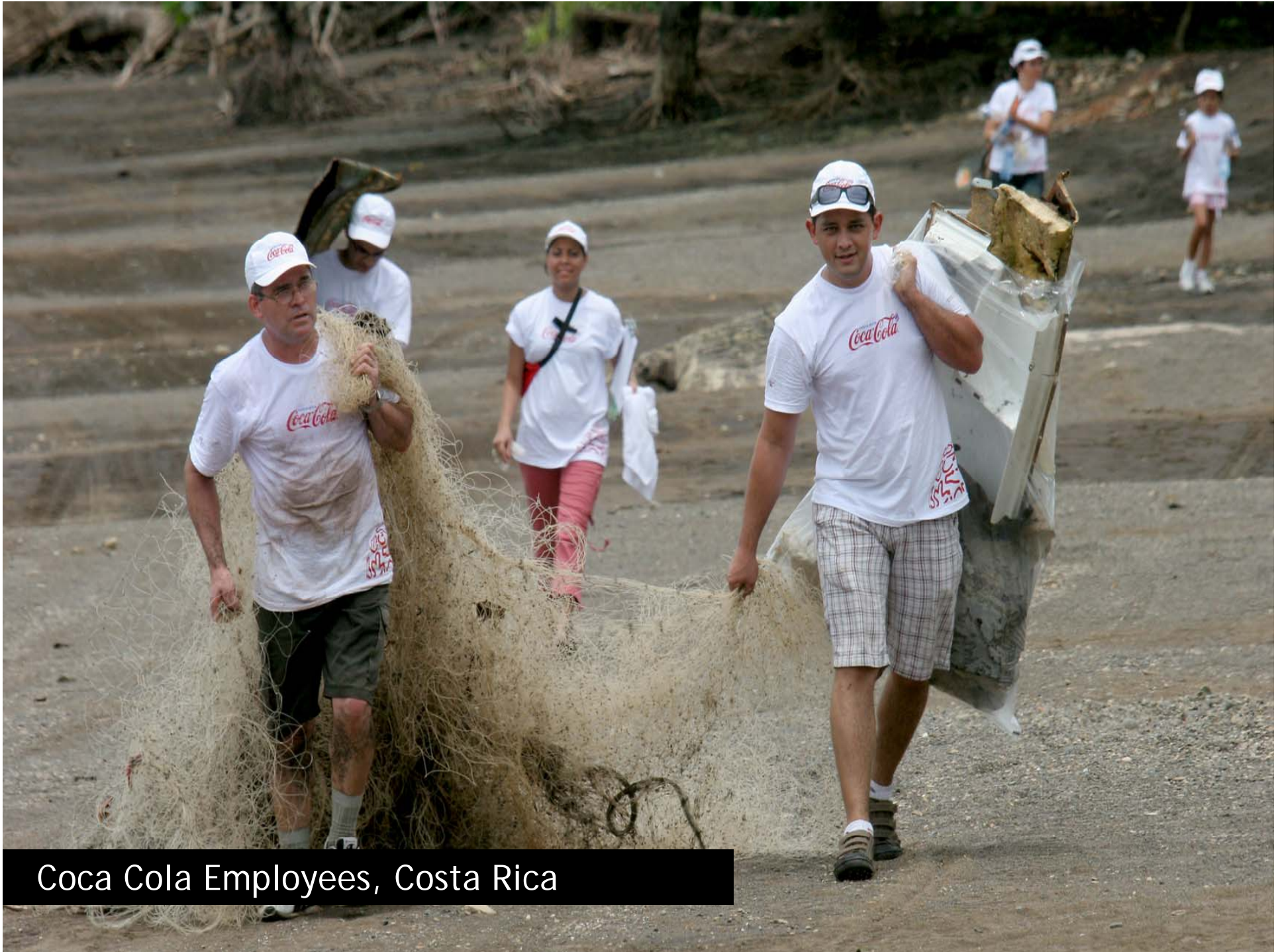
Coca Cola Employees, Costa Rica