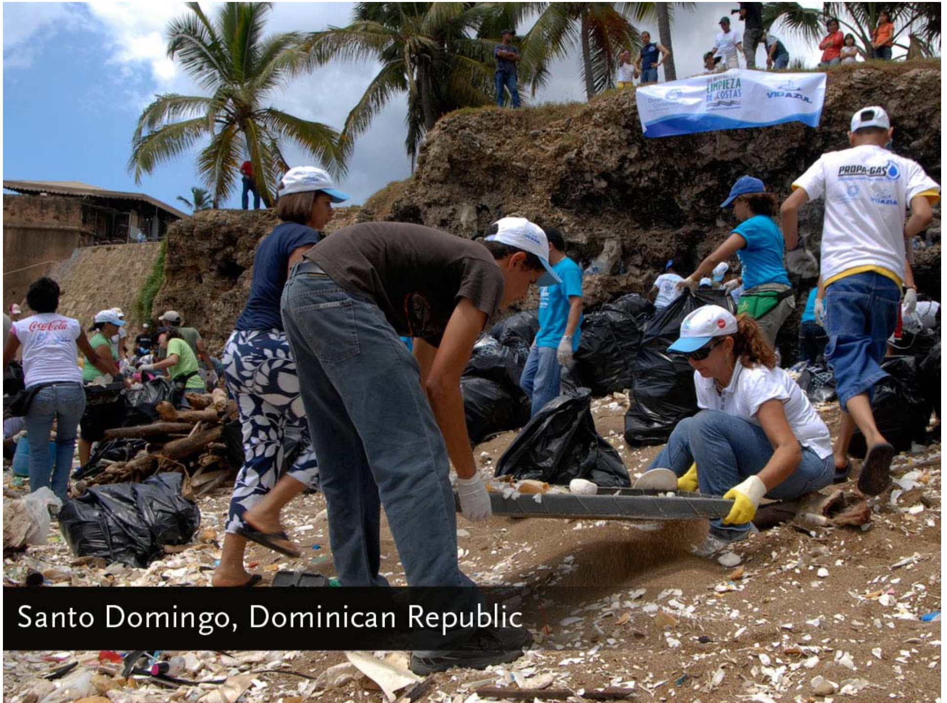
Santo Domingo, Dominican Republic