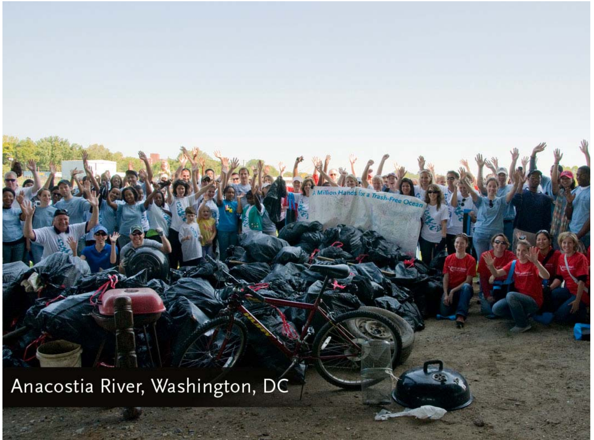
Anacostia River, Washington, DC