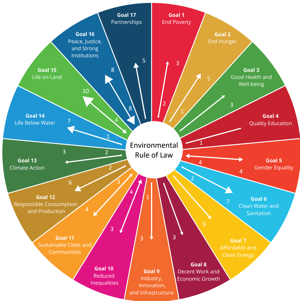
Figure 6.1: Environmental Rule of Law and the Sustainable Development Goals

Notes: An arrow pointing toward the goal indicates that environmental rule of law supports its achievement, and an arrow pointing from a goal indicates that it supports environmental rule of law. Many are mutually reinforcing. Numbers denote the number of each goal's targets that are considered to support or be supported by environmental rule of law. Because some targets both support environmental rule of law and are in turn supported by it, the numbers for some goals may total more than the number of targets enumerated for that goal.